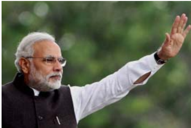
Modi leads India's sharp lurch to the Right

The U.S.-led imperialist drive to encircle both the Russian Federation (through NATO's 'eastern push') and China (via the "Pivot to Asia") also has a South Asian component. Since its election, the BJP government under PM Narendra Modi has shifted India's domestic and foreign/military policy sharply to the right, contrary to the desire of the vast majority of the people. It has announced its intentions to privatize certain state utilities, mines and farms, has cut state food subsidies for 20 million of India's poor, and is actively promoting extreme Hindu nationalism (the so-called Hindutva