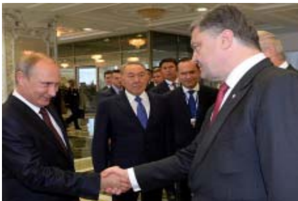
Vladimir Putin and Petro Poroshenko shake hands in Minsk, but since then the nationalist-fascist government in Kiev has repeatedly violated the ceasefire.

Recent developments in Ukraine figure prominently into US/NATO's expansionist plans. Following the U.S.-orchestrated fascist coup d'état in February 2014, the illegitimately installed regime of Petro Poroshenko moved quickly to apply for NATO membership, and to call for NATO arms to beef up its brutal onslaught in the Donbass, against cities and enclaves of the Russian-speaking minority who are fighting for regional autonomy to protect their linguistic and other national rights under threat from the Ukrainian nationalist regime in Kiev. Thousands of innocent civilians have perished in this fratricidal conflict. In violation of the truce agreement signed in Minsk earlier this year, the Ukrainian army and its National Guard (made up mostly of fascist and neo-Nazi thugs and criminals) are continuing their assault in an attempt to crush the embattled opposition forces in the