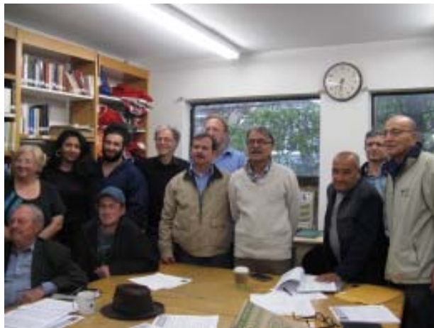
Fernando González, one of the freed Cuban Five, and Vice-President of ICAP in Havana, visited our central office in June, and thanked our Party for its solidarity

In British Columbia, the Provincial Committee has reported 23 new members in the period from January through May 2015. This is again modest but significant net growth. The Committee's March 2015 organizational report, also worthy of consideration by Party leadership not just in BC but across the country, outlines how this growth has included meaningful steps towards revitalizing clubs such as the William Stuart Club in Kelowna and the Nanaimo Club.