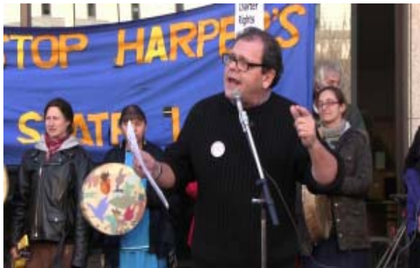
Party leader Miguel Figueroa speaking at anti-C51 rally in Winnipeg on March 14

While some specific observations are presented in the final report on the campaign, our whole party should draw certain general conclusions from our recent experiences in party-building. First, that the prevailing socio-economic and political conditions in the country are objectively driving more and more people – especially marginalized and precarious workers and sections of the youth – to abandon illusions about the capacity of capitalism to address their needs and interests, and to instead seek out systemic alternatives. Many of these have come to champion the cause of socialism as the only the revolutionary alternative to the prevailing order, and are finding a new 'political home' in the ranks of our Party. More and more are coming our way, so to speak. We base this conclusion not only on the impressive results of our party-building campaign, but also on the increased traffic on our websites, on the growing number of 'likes' on our Facebook pages, and on the significant increase in membership applications, coming from both on-line sources and through direct contact and party activity, and renewed interest in the public campaigns of our party like our recent C-51 campaign.