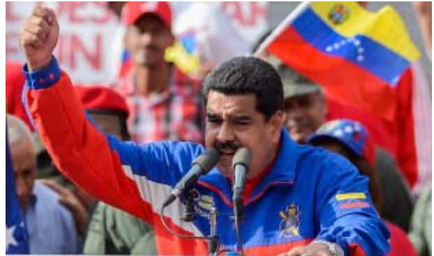
Venezuelan President Maduro announces diplomatic sanctions against US after failed coup attempt

the National Assembly, Telesur TV network, and the Defence Ministry on February 12, the one-year anniversary of violent anti-government attacks which caused 43 deaths. Canadian complicity in this coup plot, in which an RCMP member was